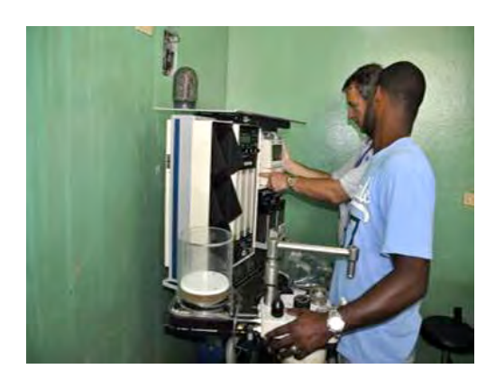
Four hours later, ready to start....